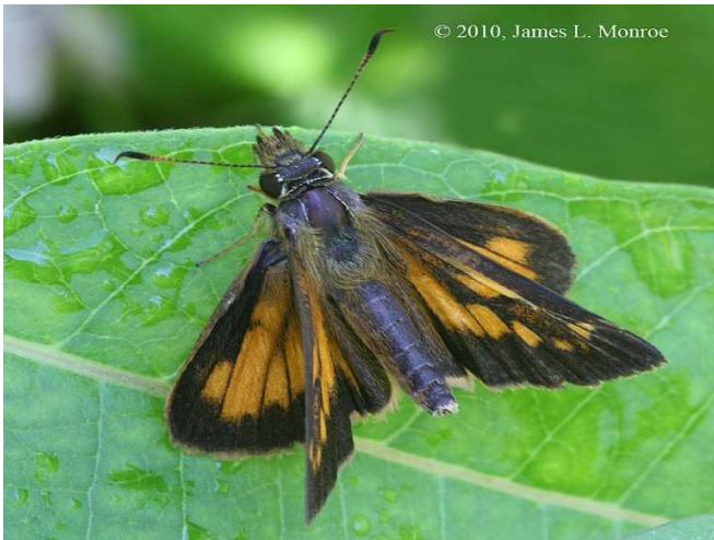
Broad-winged Skipper

The eighth Bartramian Audubon Society sponsored North America Butterfly Association 4 th of July Butterfly count was held on July 10th. Known as the Sandy Creek Count, the area covered by the 15 mile diameter circle includes the Troyer gardens in Mercer County on one side and the Polk Wetlands in Venango County on the opposite side.